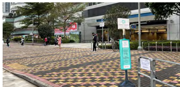
南昌站之上落客點為港鐵南昌站近A出口 Boarding point of Nam Cheong Station at MTR Nam Cheong Station near Exit A