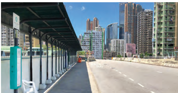
* 荃灣站上落客點站為大河道北南行停車處 Boarding point of Tsuen Wan Station at Tai Ho Road North southbound