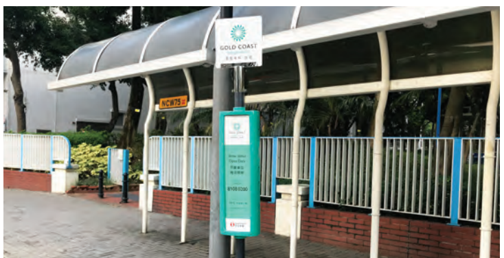
# 荃灣西站上落客點站為大河道 (D出口對面公共小巴站) Boarding point of Tsuen Wan West Station at Tai Ho Road (Minibus Stop at the opposite to Exit D)